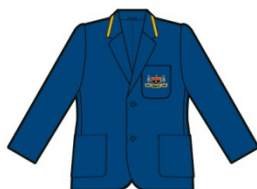
INDEX R - Collar Only