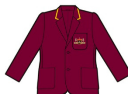
INDEX S - Collar only (with return to lapel seam)