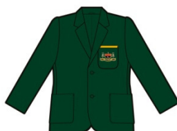
INDEX J - Chest Pocket