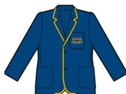
INDEX P - Collar & lapels to bottom of facing