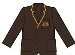
INDEX Z2 - Collar & lapels