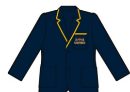
INDEX Z1 - Collar, lapels to top button & top pocket