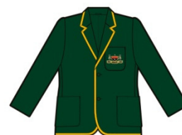
INDEX F - Edges only